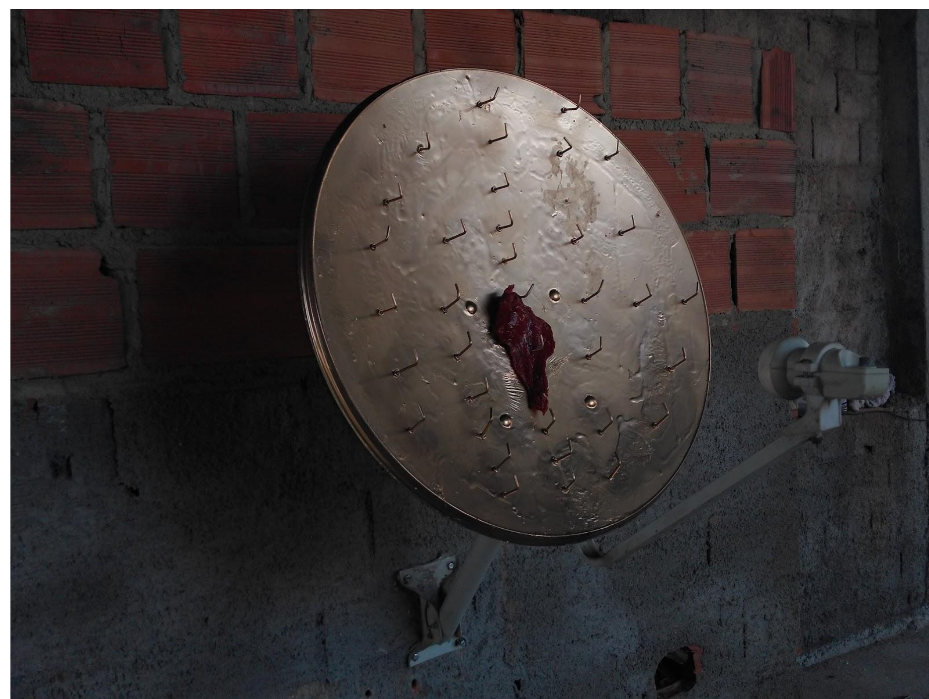
Transmission (2020) Heart and salt over antenna TV, L screws and jet paint. Diameter 60cm